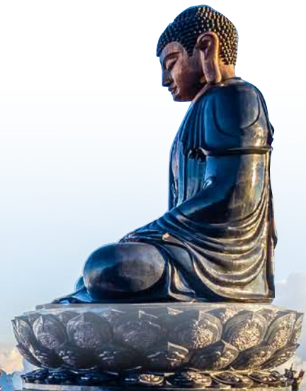
番西邦山顶 Fansipan Peak