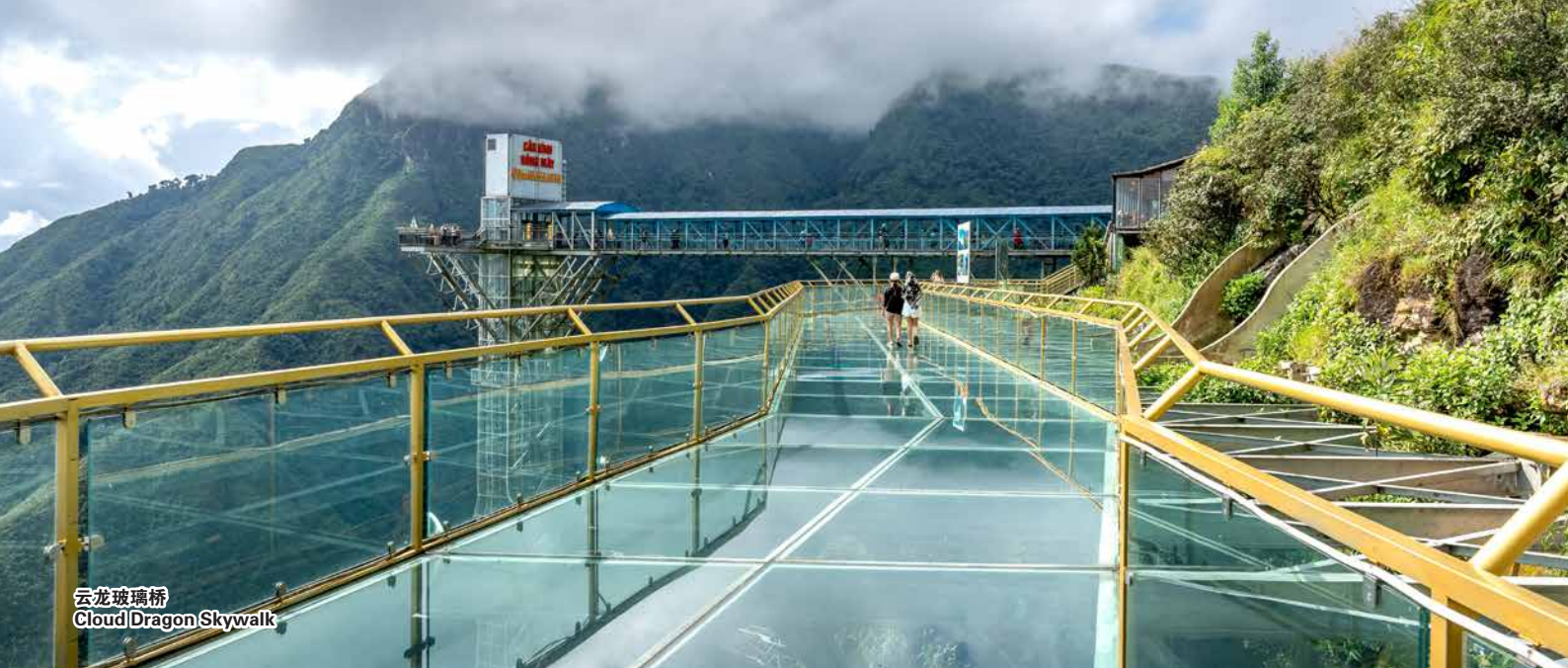
云龙玻璃桥 Cloud Dragon Skywalk