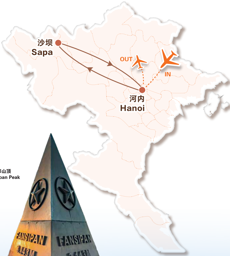
番西邦山顶 Fansipan Peak

※ Sequence of the itinerary is subject to change according to the final flight confirmation